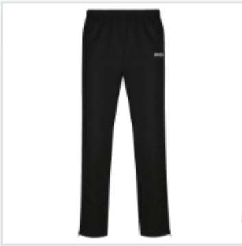
WBH Track Pants SMF B 7-12