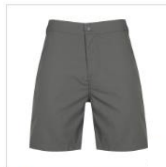
WBH Shorts EB Boys LG 7-12