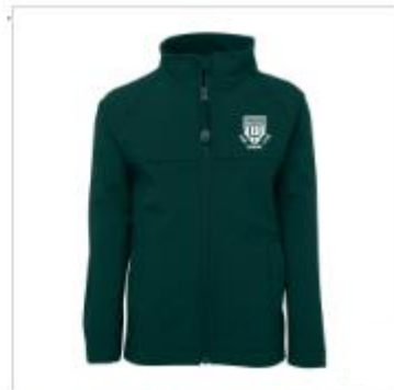
WBH Jacket Softshell Bottle Uni 7-12