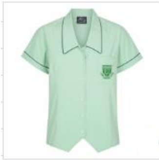
WBH Blouse S/S Green PC 7-10