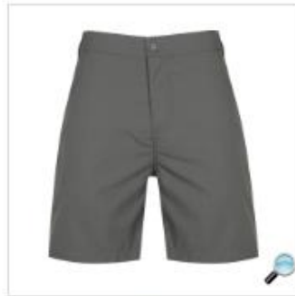
WBH Shorts EB Boys LG 7-12