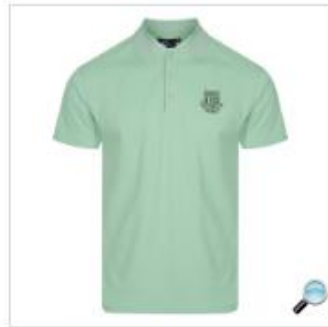
WBH Polo Formal Uni Green CB 7-10