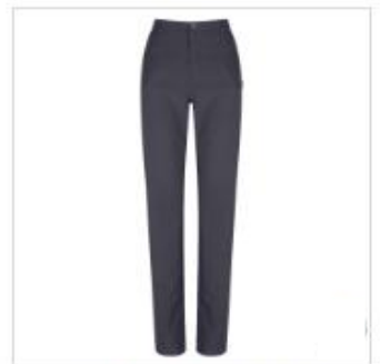
WBH Pants Formal Girl Charcoal 7-12