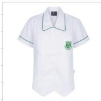
WBH Blouse S/S White 11-12