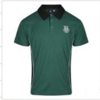
WBH Polo Sport Boys CB 7-12