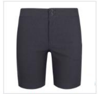
WBH Short Formal Girl Charcoal 7-12