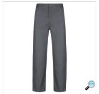
WBH Trousers EB FF C (G) 7-12