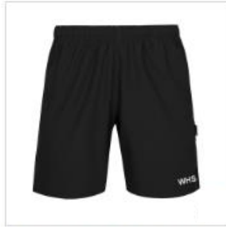
WBH Short Sport SMF B Boys 7-12