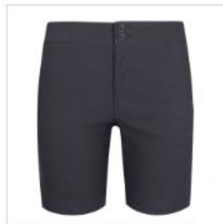
WBH Short Formal Girl Charcoal 7-12