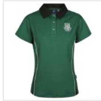
WBH Polo Sport Girls CB 7-12