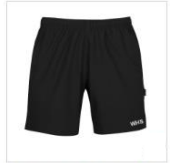
WBH Short Sport SMF B Ladies 7-12