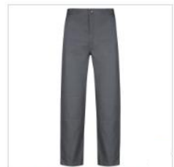
WBH Trousers EB FF C (G) 7-12