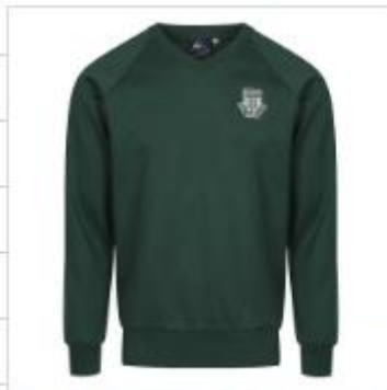
WBH Jumper Fleece Bottle Uni 7-12