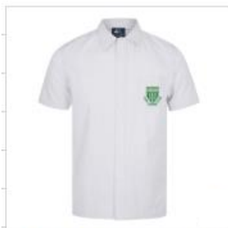
WBH Shirt S/S White Boys PC 11-12