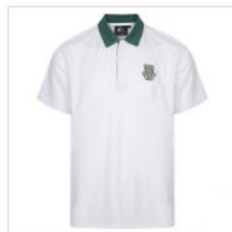
WBH Polo Formal Boys W CB 11-12