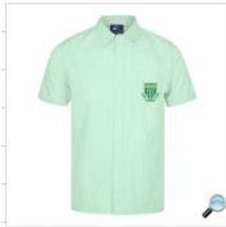
WBH Shirt S/S Green Boys PC 7-10