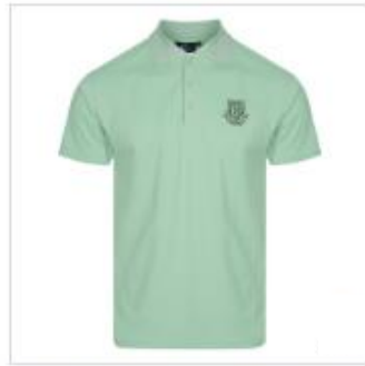
WBH Polo Formal Uni Green CB 7-10