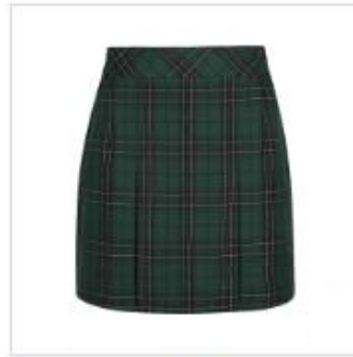
WBH Skirt Tartan Pleated PV 7-10