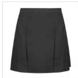
WBH Skirt Grey PV 11-12